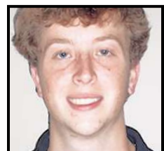
PHILIP DEUTSCH AT THE WORLD CUP